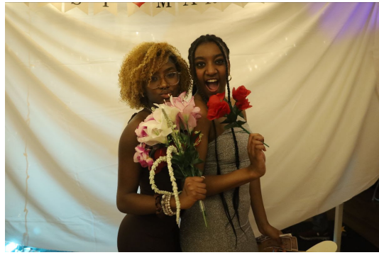
... a Superbowl party in the Dining Hall ...