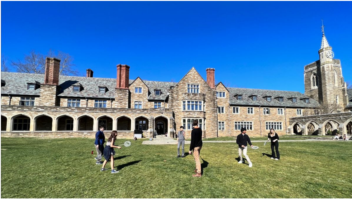
III Form students enjoyed a Form function on the Front Lawn on February 23 that left no doubt: spring is on the way!