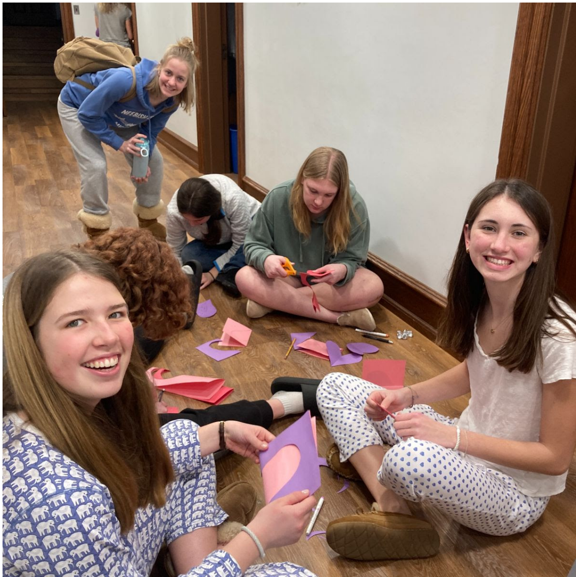
Forestry students spent the month of February conducting trail maintenance and enjoying some epic Delaware sunsets out in the farm fields.