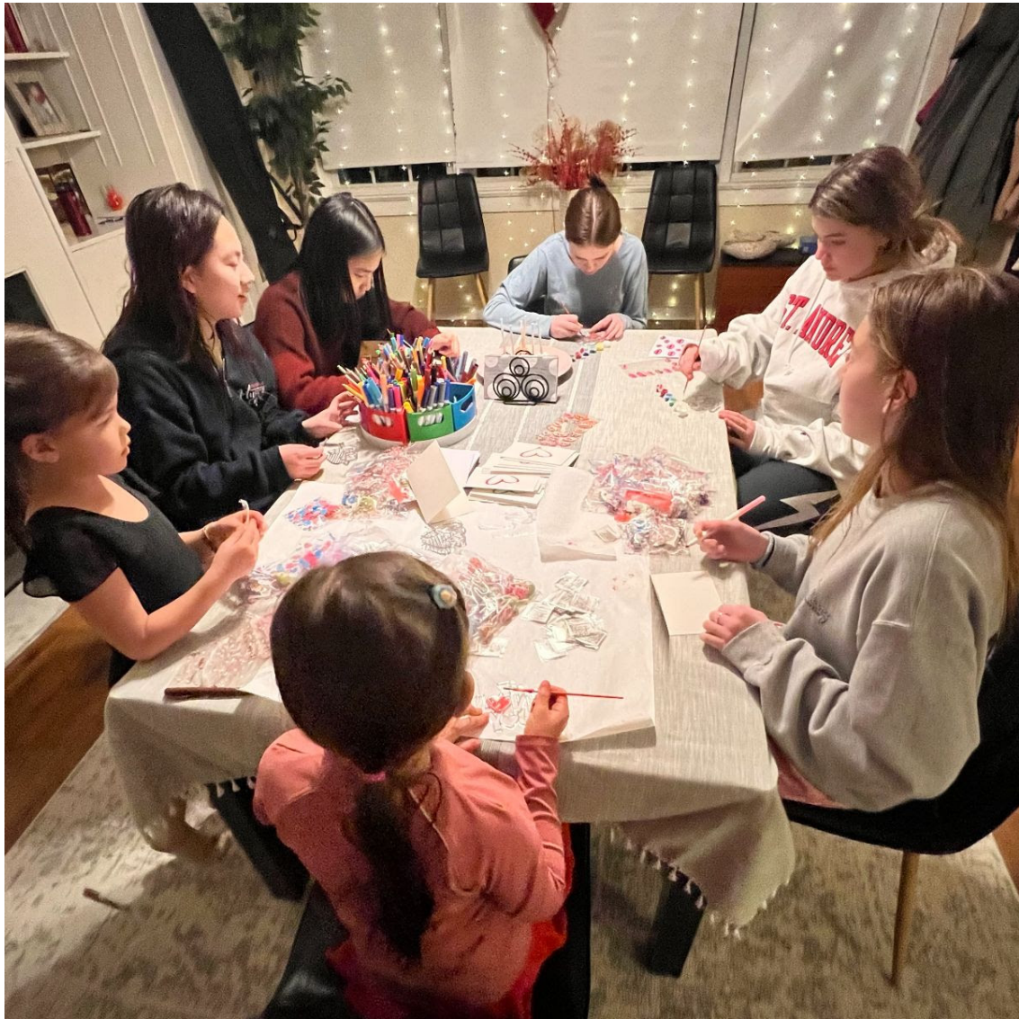
... as did Moss residents!