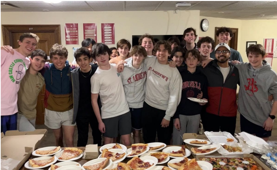
The Huang-Murphy Advisory enjoyed a Valentine's-making function...