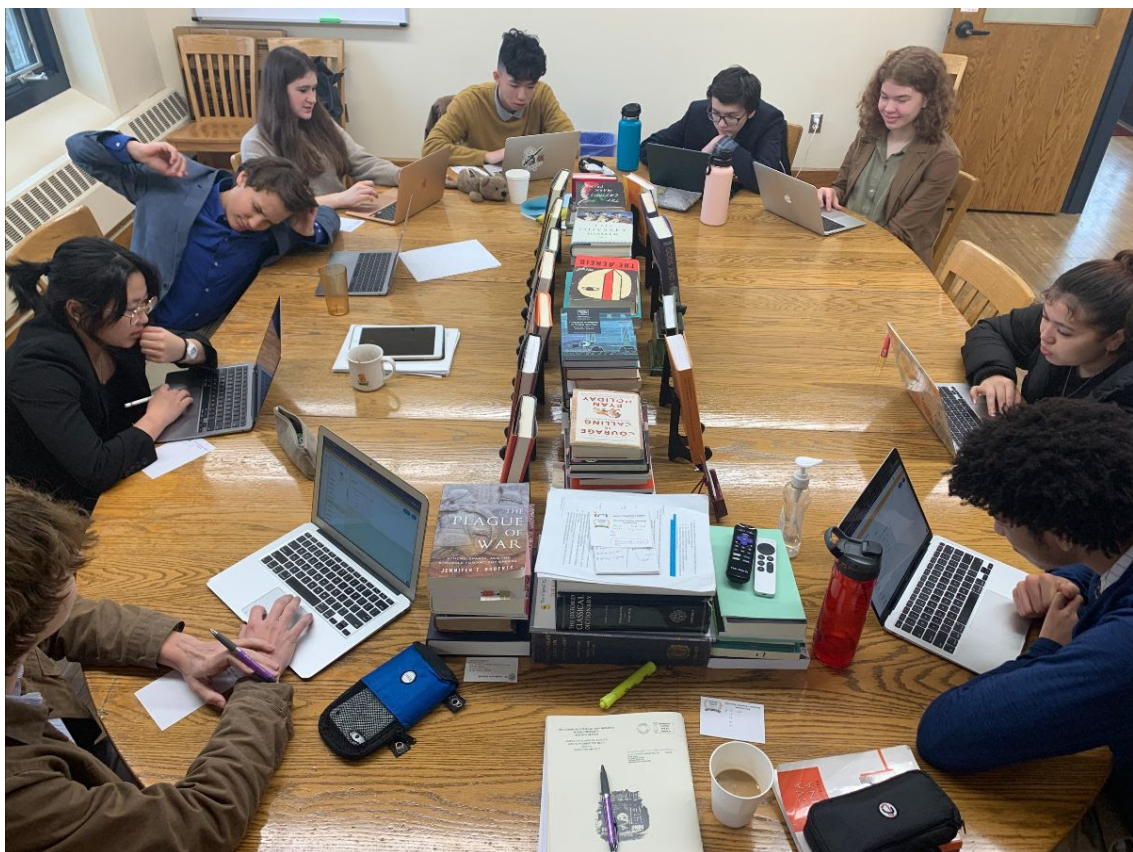
Mrs. Carroll's A Block Algebra 1 students got to enjoy class and a pancake breakfast at the Carroll home on Monday morning.