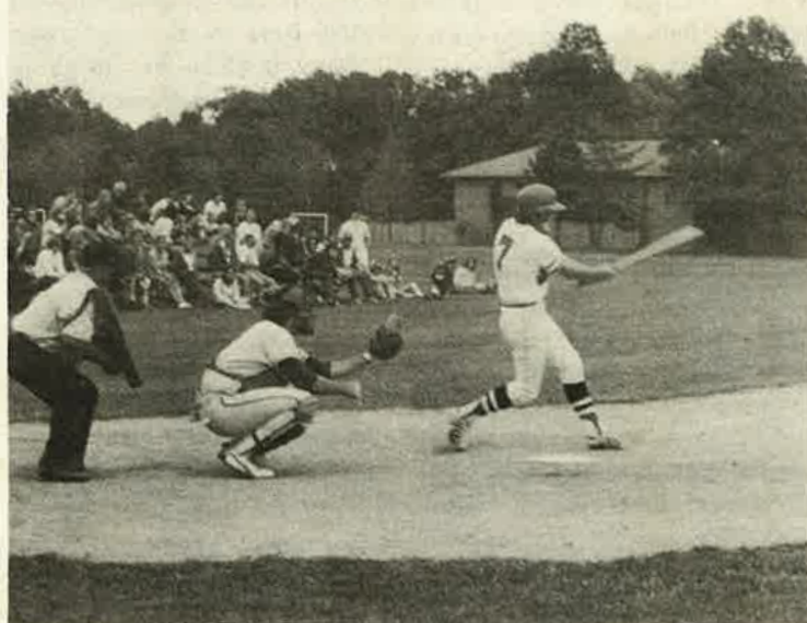
S.A.S. batsman takes a mighty cut.