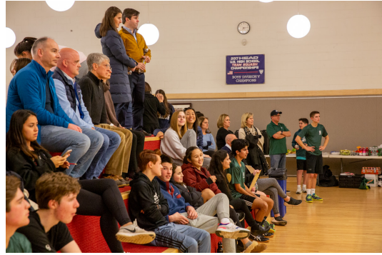
Girls Squash prepares for their match against Conestoga High School.