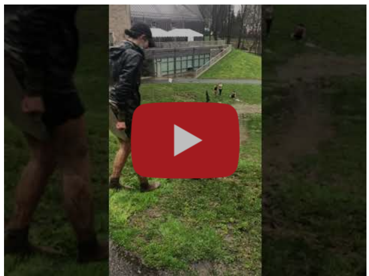
Just hanging around....