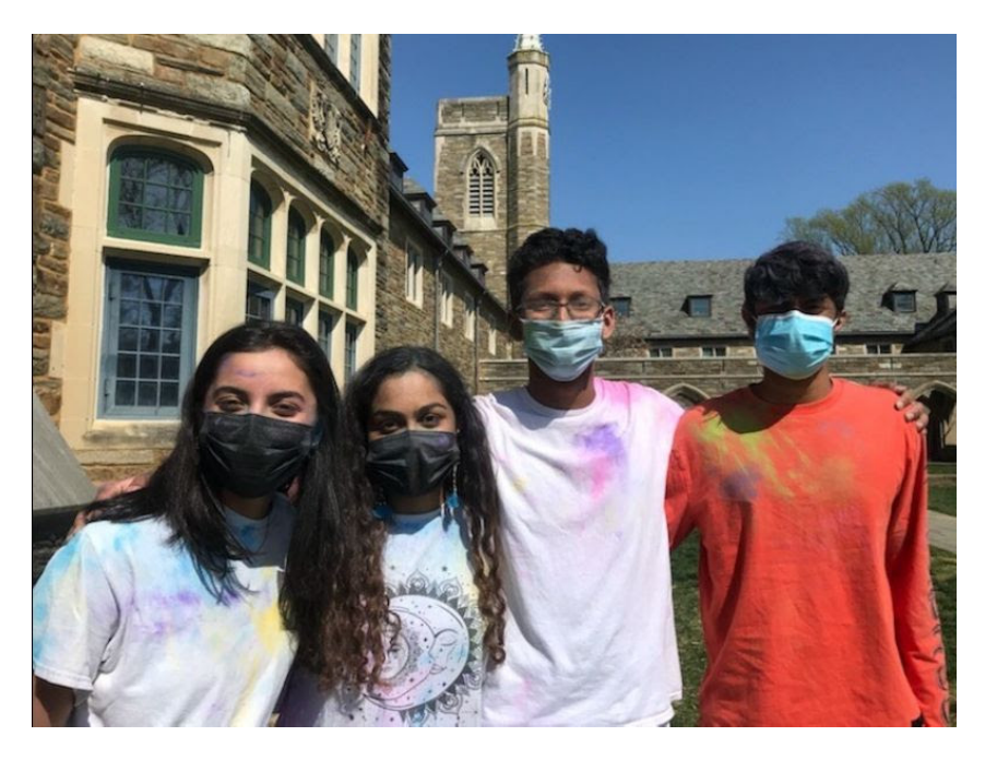
The Class of 2021 enjoyed a pizza party thanks to their parents, who won a <u>Saints Fund giving participation challenge in February 2020</u>. Since students never came back to campus in that school year, we held off throwing the party until this year. Class of 2022 parents tied in the challenge and juniors will be enjoying their pizza party next week. Don't worry—there will be future opportunities for parents to compete in giving participation challenges and win prizes for their students this spring!