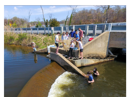
Life in O'Brien