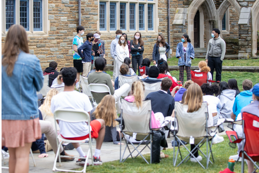
... and elsewhere around campus. Crafts! Yoga! Advisory hangouts!