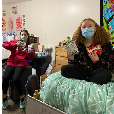
Residents of K Dorm were happy to move back in on Tuesday!