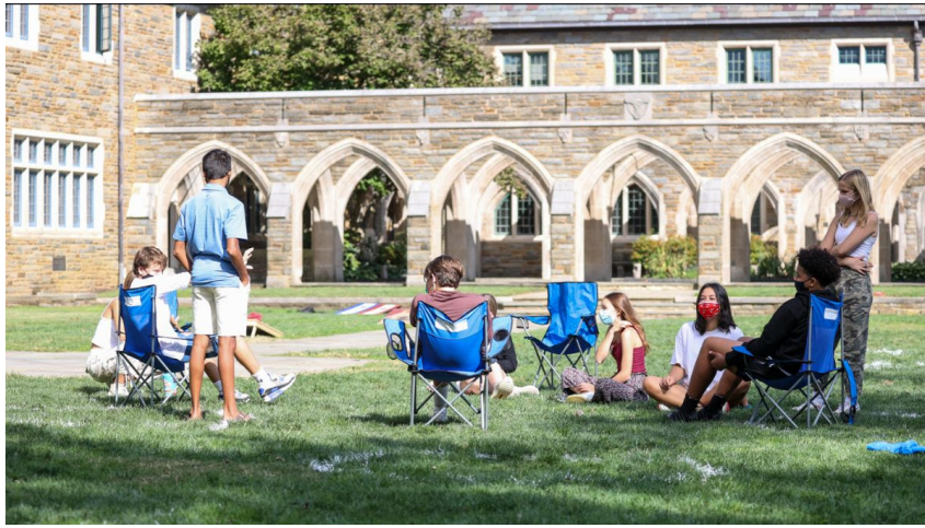
Students and faculty enjoyed a Thursday afternoon cookout on the Front Lawn.