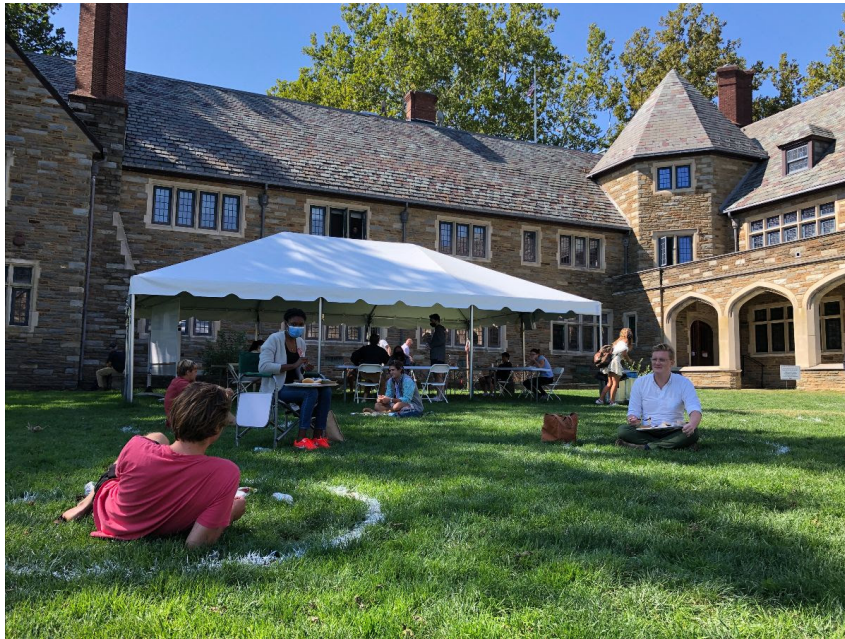
After their move-in days last week, III Formers spent Friday afternoon in small group activities led by faculty. Activities included: hiking, bullet-journaling, Pictionary, skateboarding, yoga & meditation, mountain biking, charades, marshmallow/spaghetti structure-building, gardening, sidewalk chalk-drawing, and much more.