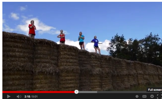
Season 2, Episode 2