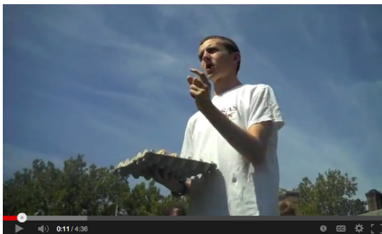
Season 2, Episode 1